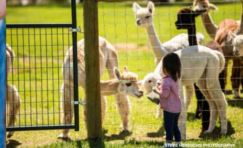
STEVE HEINRICH'S PHOTOGRAPHY

Find other Oregon Food Trails at oregonfoodtrails.com .